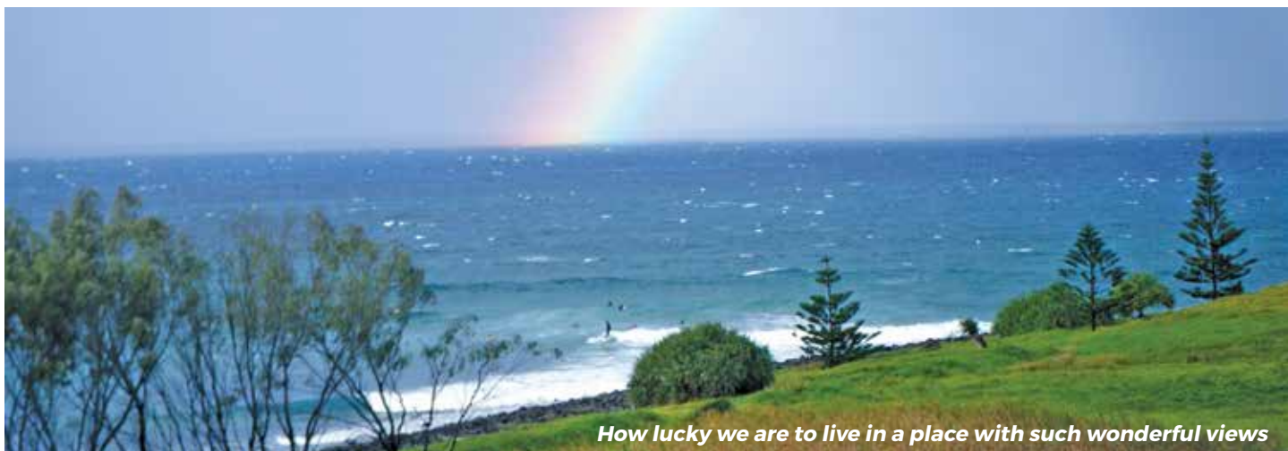
How lucky we are to live in a place with such wonderful views